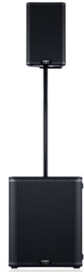
QSC Sub and Top

The system is scalable for smaller venues and powerful enough for outdoor events.