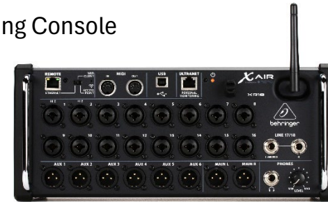
X-Air XR18 Mixer